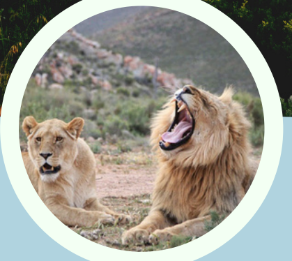
AQUILA SAFARI FULL DAY